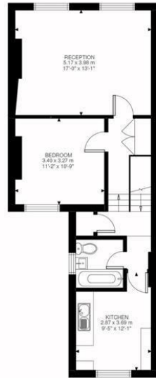
First Floor 612 ft²